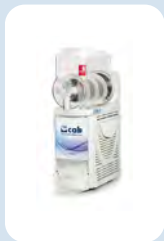
Faby Cream 1 vasca