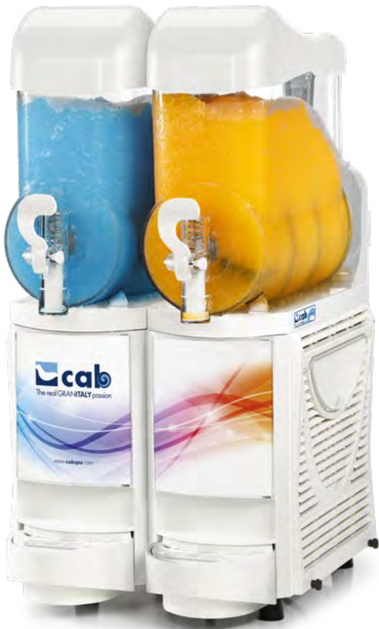
2 TANK VERSION