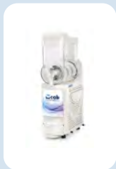
Faby Skyline 1 vasca