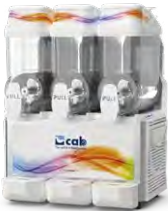
3 TANK VERSION