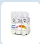
Faby Skyline 3 vasche