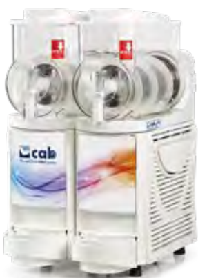
2 TANK VERSION