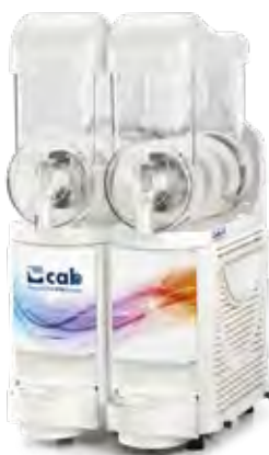
2 TANK VERSION