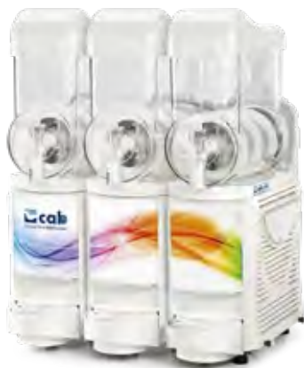
3 TANK VERSION