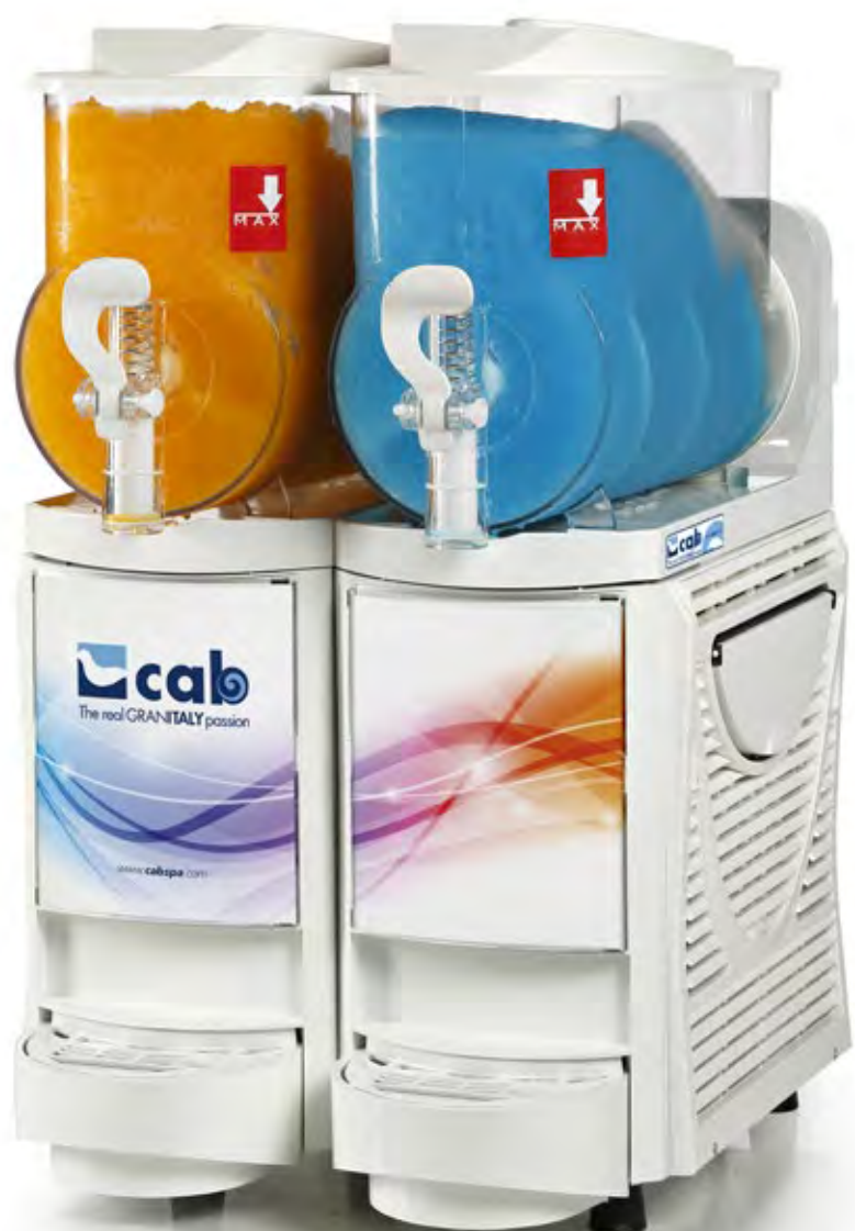
2 TANK VERSION