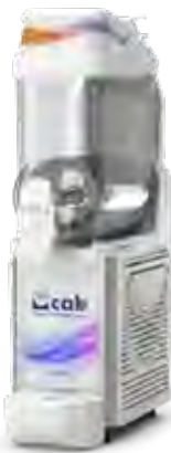
1 TANK VERSION