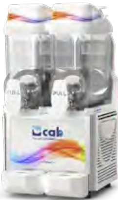
2 TANK VERSION