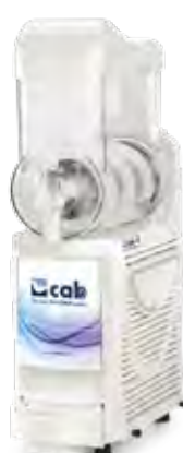
1 TANK VERSION