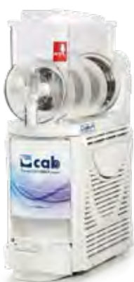
1 TANK VERSION